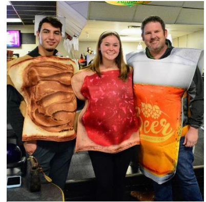
Bowling With Dad/Halloween Event