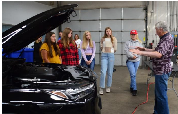
Señorita Personal Finance and Car Care Clinic