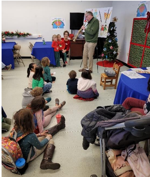
Peter And The Wolf Event