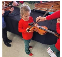
Peter And The Wolf Event