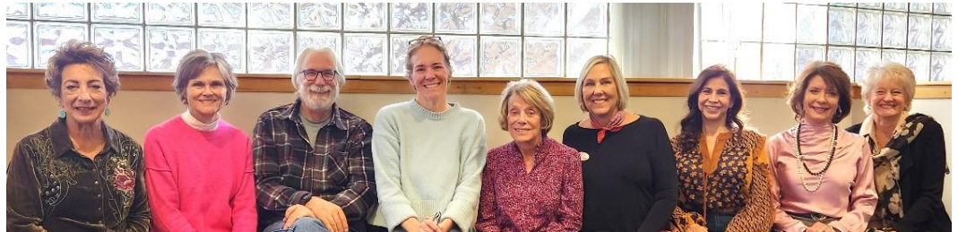
2023/2024 Music Guild of NM Board of Directors

Spring Fundraiser Preview! Stay tuned for more Flower Power info to come!