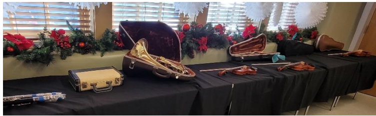
Peter And The Wolf Event