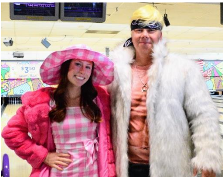
Bowling With Dad/Halloween Event