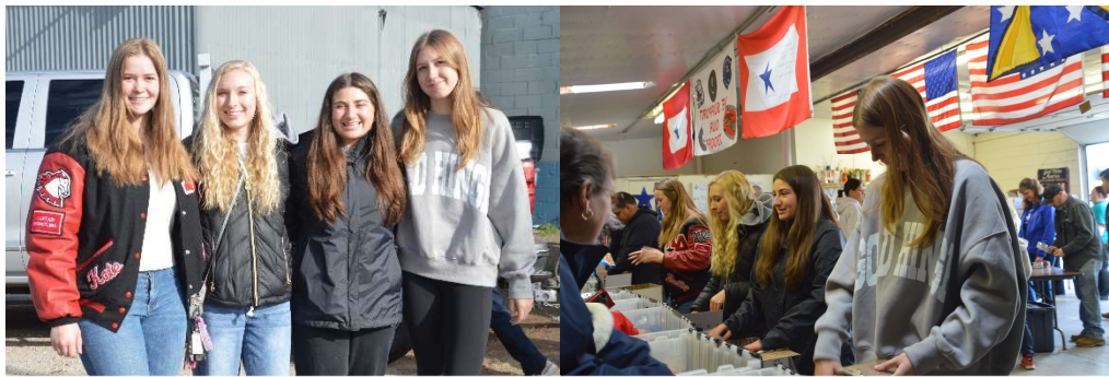
Señorita Volunteers for Blue Star Mothers Packing Event

Señoritas packed over 350 boxes with Girl Scouts cookies, sala, lots of snacks, socks, and playing cards, and had a wonderful time while doing it for the Blue Star Mother's Packing event. The Blue Star Mothers organization not only provides support for active duty service personnel, promotes patriotism, assists Veterans organizations, but is available to assist in other homeland volunteer efforts and send the packages to enlisted men in destinations that included submarines based out of Cuba, Italy, and outside El Paso, across the Mexican border. A few of the Señoritas socialized afterwards for lunch at El Camino Dining Room, built in 1950 along Route 66 and appears in the Breaking Bad film projects. What better place for them to discuss their upcoming photo sessions, beauty makeup event at MAC Cosmetics, and their Father/Daughter Waltz lessons later this month!