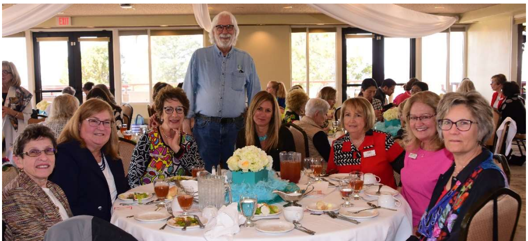
Señoritas Volunteering for Blue Star Mothers, above. March Member Luncheon, below

The Jackie McGehee Young Artists' Competition