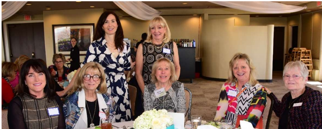
March Membership Luncheon